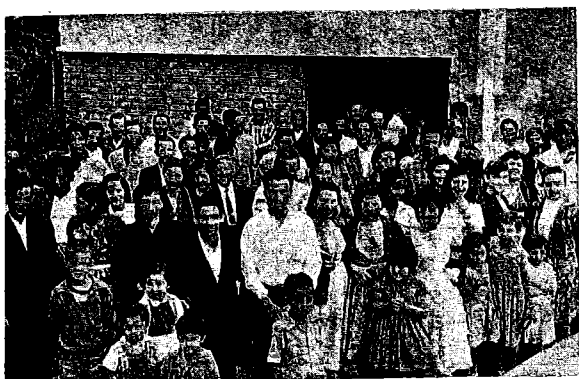
The retreaters were very happy.